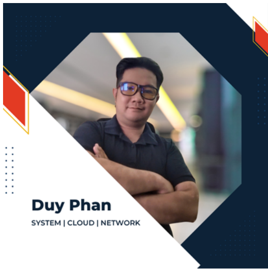
Duy Phan SYSTEM | CLOUD | NETWORK